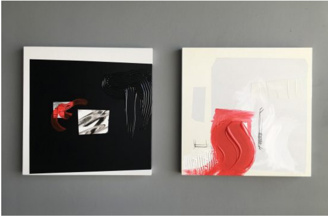
Simone DeSousa, "Calculating with Absence (The Temple of Bliss and Emptiness 1 and 2)", Acrylic on Panel, 2016

DeSousa's early career in architecture is evident in her work- abstract and sharply minimal as it can be, it speaks in the silent, echoing language of space. The more built-up works read like cityscapes, layers of geometric forms and linear gestures crowding the picture plane, built up with industrial surface texture- swirls of resin and caulk. Some of those same textures appear in the quieter works, where they are accompanied by the barest of architectural scribbles, or simply given an unconventional format for a setting- DeSousa's panels bend, nick off at corners, elongate, and spread along the gallery walls more like evolving visual conversations than self-enclosed paintings.