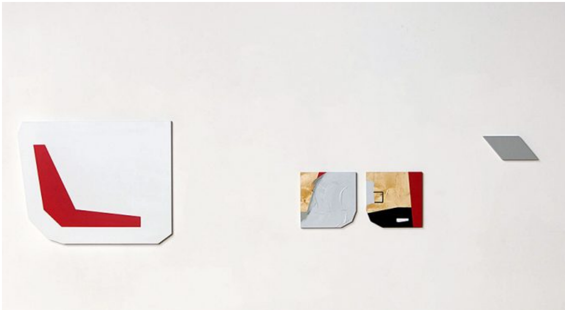
Simone DeSousa, "Calculating with Absence (The Secret Path)" Wall , Acrylic on Panel, 2016

DeSousa's early career in architecture is evident in her work- abstract and sharply minimal as it can be, it speaks in the silent, echoing language of space. The more built-up works read like cityscapes, layers of geometric forms and linear gestures crowding the picture plane, built up with industrial surface texture- swirls of resin and caulk. Some of those same textures appear in the quieter works, where they are accompanied by the barest of architectural scribbles, or simply given an unconventional format for a setting- DeSousa's panels bend, nick off at corners, elongate, and spread along the gallery walls more like evolving visual conversations than self-enclosed paintings.